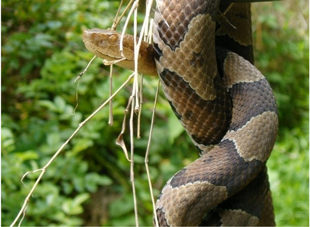
Northern Copperhead from the LHS picture library